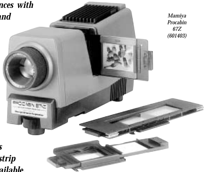
Mamiya Procabin 67Z (601403)

The projector is compact, light and easily portable. It accepts 85x85mm glass-mounted 6x6 or 6x7cm transparencies in its drop-in slide holder. Conventional push-pull slide carriers for 6x7, 6x6, 6x4.5cm and 35mm slides are available as optional accessories. A filmstrip carrier for unmounted transparencies is also available.